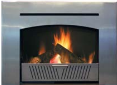
The Grand with stainless steel surround and control cover.

However you won't love The Grand for its looks alone! It's also a very practical way of heating your home. One press of the electronic ignition button and you'll be enveloped in warmth. It's a warmth that can easily be controlled using high or low flame and one of 3 fan settings. Because The Grand runs on LPG or Natural gas, there's no ash or wood to chop. So isn't time you became comfortable on a grand scale!