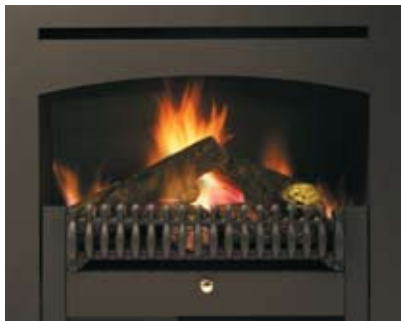
The Grand - Standard.

Type 1 burner and log kit, with manual valve, is available for existing fireplaces. Height of 300mm includes log kit. The burner is 300mm deep.