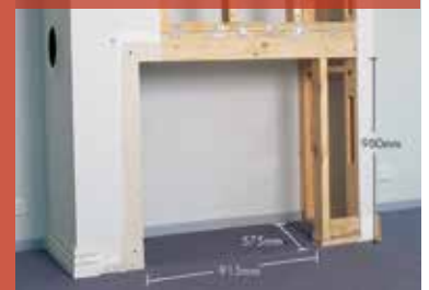
Zero Clearance Box positioned in framework