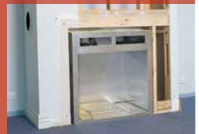
Heater fitted to Zero Clearance Box