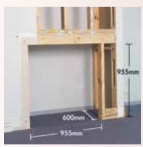
Timber framework partially clad with 12mm Villa Board