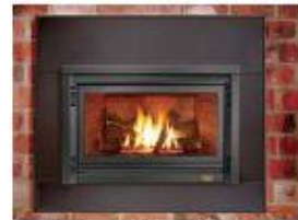
Rectangular Finish Panel Offers a finish to fireplaces that are elevated. This panel will cover up to 7" (178mm)