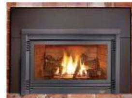
Rectangular Finish Panel Available in 3 sizes 4 x 6" Panel: 737mm(h) x 1016mm (w) 8 x 10" Panel: 848mm (h) x 1122mm(w) 10 x 13" Panel: 924mm(h) x 1224mm(w)