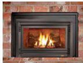
Rectangular Finish Panel Can be modified to fit inside original fireplace