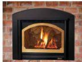
Arch Finish Panel Available in 2 sizes 8 x 10" Panel: 848mm (h) x 1122mm (w)