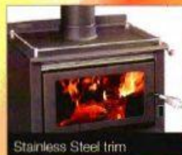
Stainless Steel trim