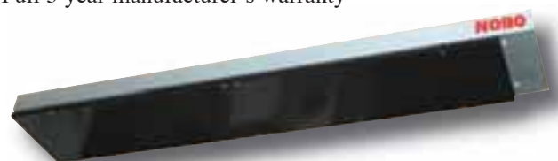
TVH Radiant Ceiling Mounted Panel Heater