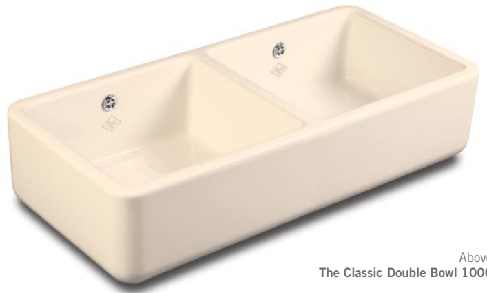
Above: The Classic Double Bowl 1000.