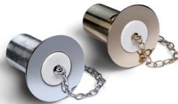
Slotted Waste/Plug and Chain