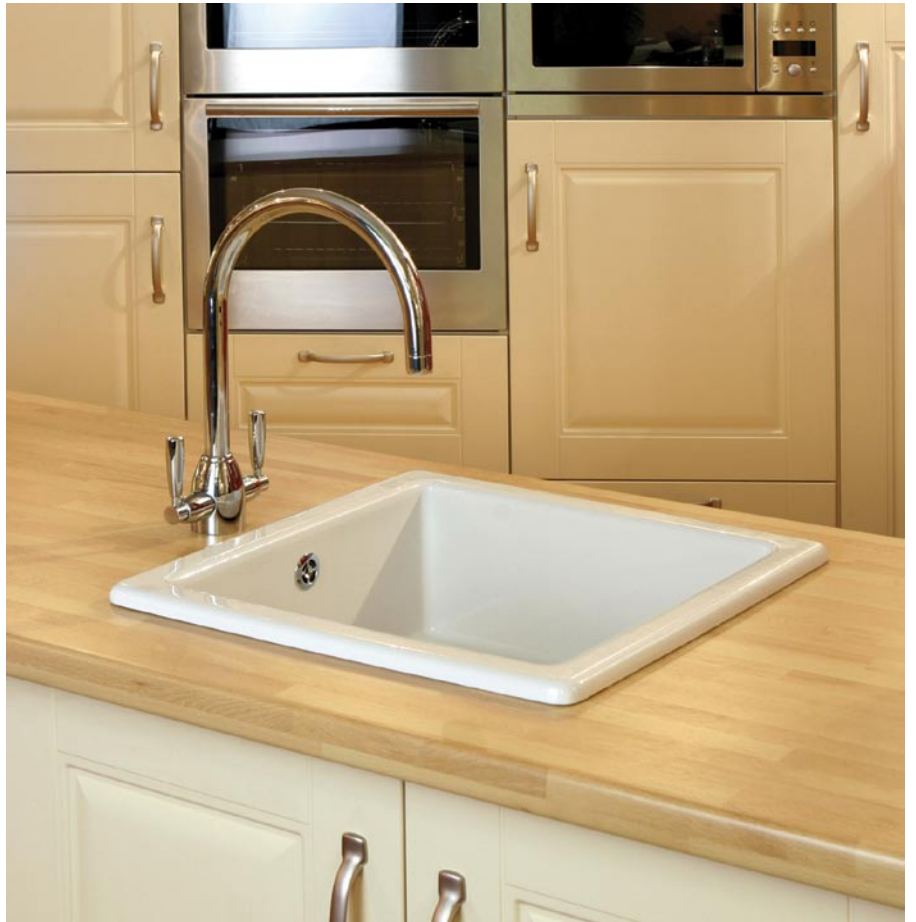
Above: The Classic Square sink.