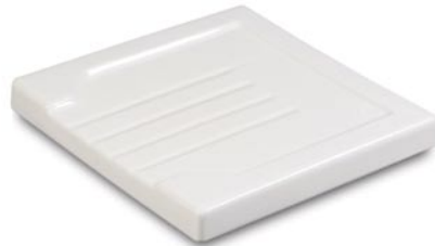
Small Fluted Drainer

Width: 610mm, Depth: 460mm, Height: 50mm.