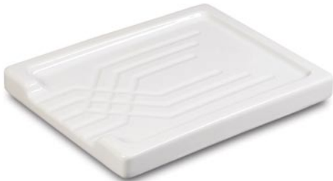
Large Fluted Drainer

A range of accessories designed to complement your fireclay sink.